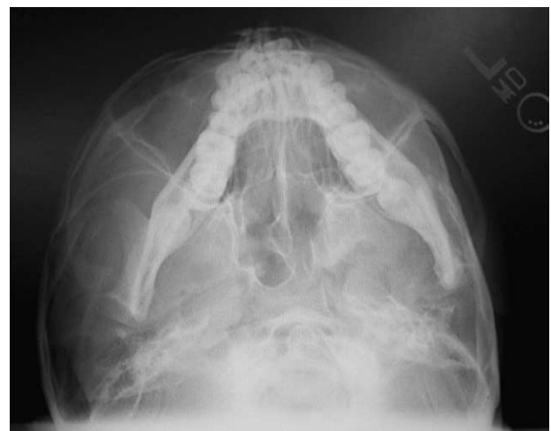
FIGURE 2. Postoperative submentovertex radiograph demonstrates excellent reduction of depressed arch fracture using the towel clip technique.

possess esthetic deformities or functional limitations demand surgical reduction (Figs 1, 2). Here we describe a simple and effective method for the reduction of the isolated arch fracture that has been used with great success by the senior author (E.J.D.) for over 25 years.