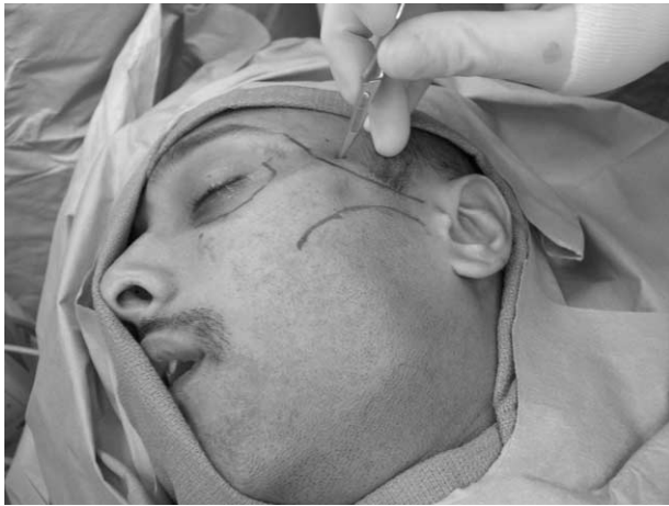
FIGURE 3. Placement of superior stab incision.